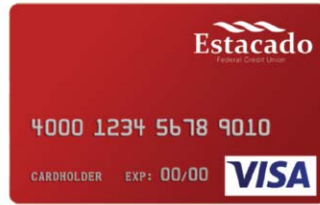
Estacado Platinum Card