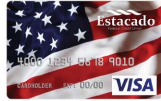
Estacado Traditional Card